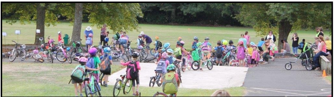
BELOW: STUDENTS SET FOR DUATHLON